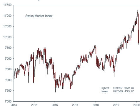
The SMI consolidated last week but did not form a new sequential low relative to the previous week. The recovery remains fragile and needs to overcome short-term resistances at 9680 and 9750 points, failing which a pullback to 9390 points is possible.

Stocks made a firm start to the week as many countries continue to unshackle their economies after the outbreak. By contrast, investors are taking a cautious stance pending the next batch macroeconomic figures (European and US PMIs, in particular). Their mood is reflected in the rising price of gold – a safe haven – to its highest level since 2012. No doubt about it: the breathtaking recovery in equity indices from their March lows is running well ahead of the economic reality.